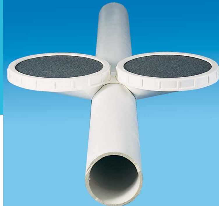
DualAir® diffuser with ceramic media.