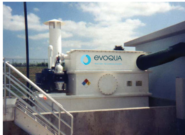
TERRELL, TEXAS RJ-2000 ONE TON CAPACITY

Email odorcontrol@evoqua.com or visit www.evoqua.com/rj2000 to connect with an expert.