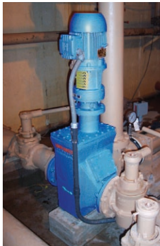
A TASKMASTER TM851206 inline grinder with "drop-in" housing.