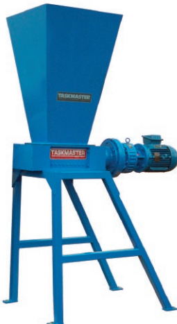
The TM8500 features fewer moving parts for easy maintenance and durability.