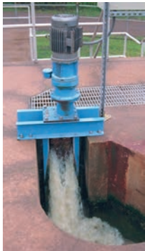
TM8532 in municipal wastewater channel.