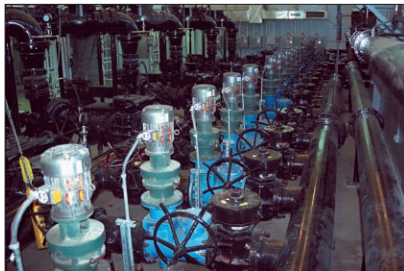
An arsenal of Super Shredders protects a major metropolitan wastewater facility.