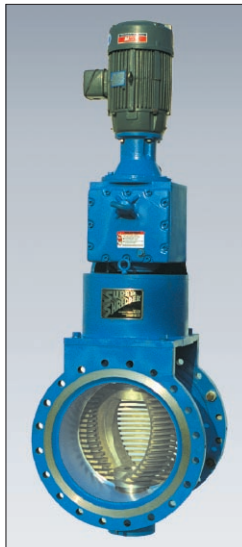
Model 2400 Super Shredder with 24" flanges