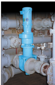
Super Shredder in sludge re-circulation line.