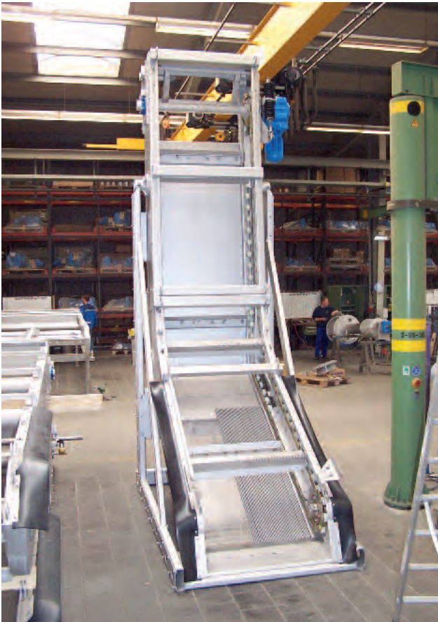
HUBER Rake-Max®-hf unit in our factory before delivery: The flat bottom section which provides favourable hydraulic conditions is clearly visible.