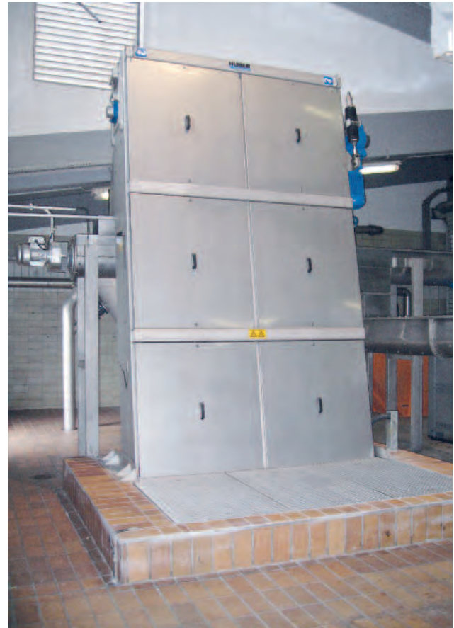
From the outside the HUBER Rake-Max®-hf is not distinguishable from a RakeMax® unit, the well-proven basic machine design.