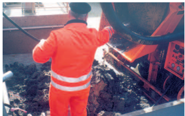
Tanker vehicle discharging onto the vibrating grate