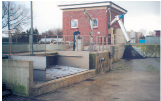
Long distances between the tank and Grit Washer are no problem.