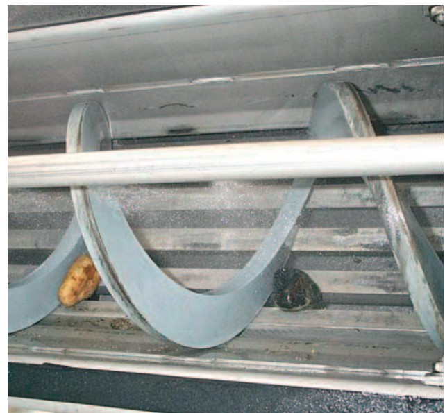
Washing and separating grate with spray bar