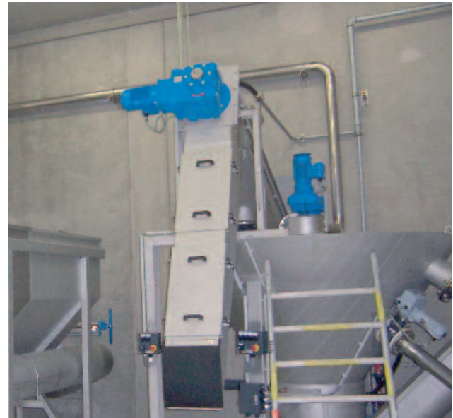
Installation example: grate separator installed on top of the COANDA Grit Washer