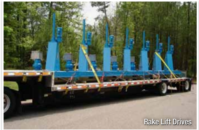
Rake Lift Drives