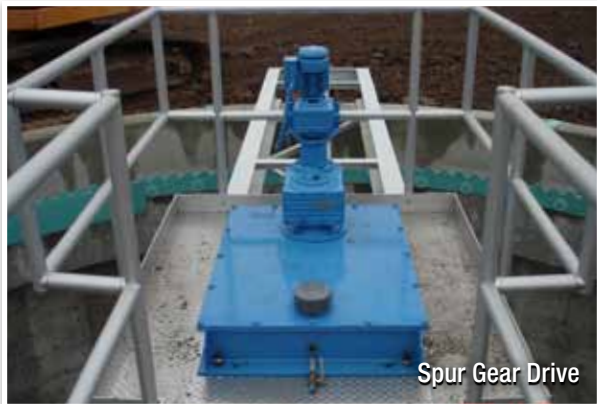
Spur Gear Drive