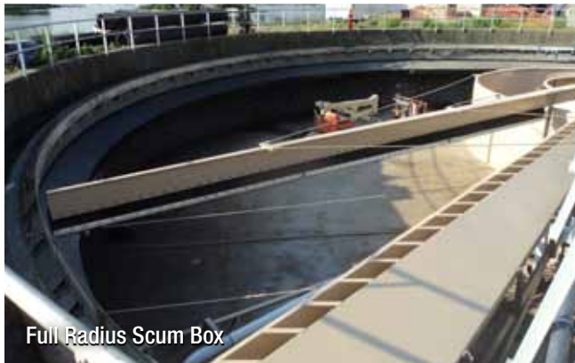
Full Radius Scum Box