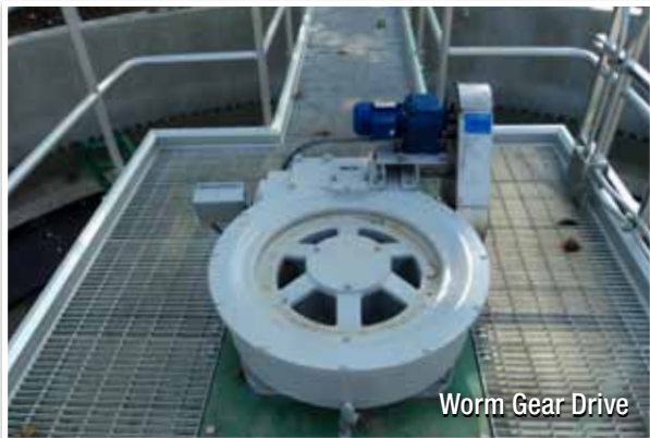
Worm Gear Drive