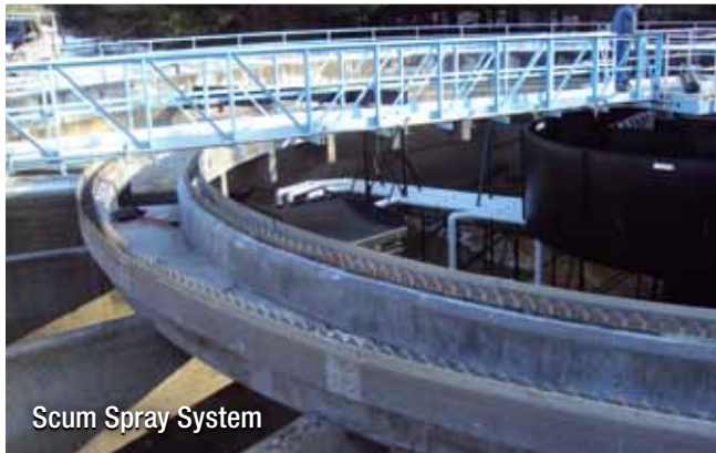
Scum Spray System