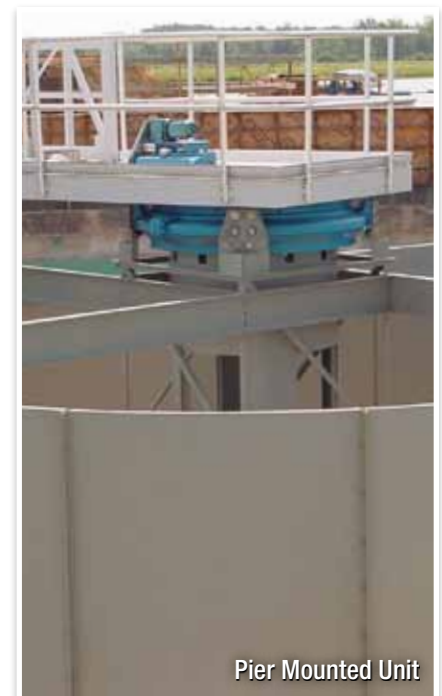
Pier Mounted Unit