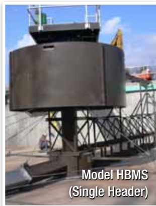
Model HBMS (Single Header)