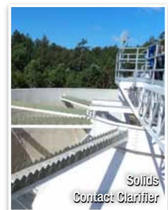
Solids Contact Clarifier

Flocculating clarifiers are particularly effective for flocculation and clarification of municipal and industrial water supplies, screened primary sewage, wastes with high grit content, and industrial wastewater containing heavy settleable solids. Flocculating units can also be adapted to tertiary waste treatment as well as potable water coagulation. Individual flocculators or concentric turntable style flocculators are available. Properly sized paddle area and accurately computed velocity gradients ensure optimum performance.