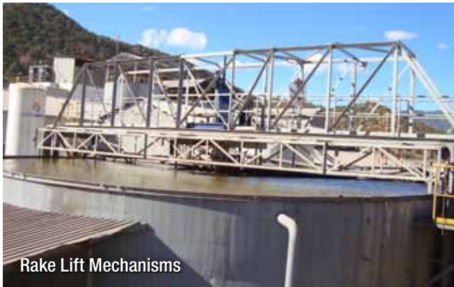
Rake Lift Mechanisms