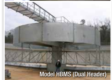
Model HBMS (Dual Header)

Model HBMS collectors utilize a rotating tapered sludge collection header and manifold assembly to remove activated sludge. Settled solids are collected through orifices located along the full length of the header. Varying orifice size and spacing are computer generated to provide the desired velocities throughout the entire header assembly. Suction is typically provided by direct connection of the return activated sludge pumps to a central draw-off manifold at the tank bottom. An optional rake arm opposite the sludge header is available to collect any remaining solids. Sludge headers are offered in either single or dual configurations.