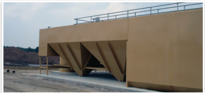
Shop Built Rectangular Plant For Flows up to 100,000 GPD