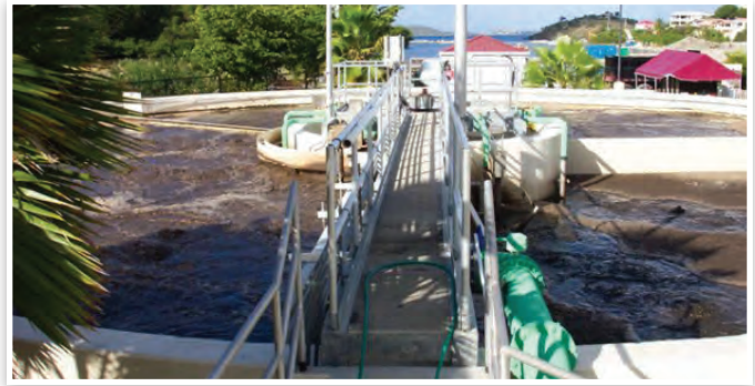
Circular Field Erected Plant For Flows up to 1,000,000 GPD