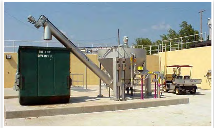
Grit Washer for exceptionally clean and dry grit.