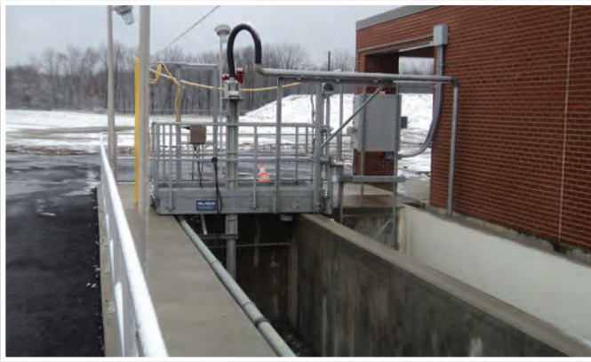
Bridges can be fitted with scrapers and/or pumps for grit removal.