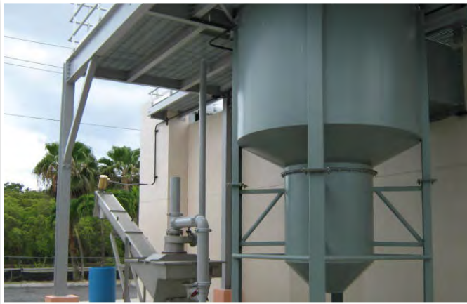
Optional steel tank design.

Waste-Tech has been directly involved in the design, manufacture, supply, start up and testing of the XGT™ vortex grit removal technology since 1984. Based on experience with many installations, we have introduced a number of significant improvements to the system. These include the sloping floor design, self-priming grit pump, grit washer and X-impeller. The XGT™ vortex grit system is designed to efficiently remove both fecal and vegetable matter ( corn, rice, beans, peas etc. ) from the grit in the grit chamber resulting in cleaner grit with considerably lower organic content.