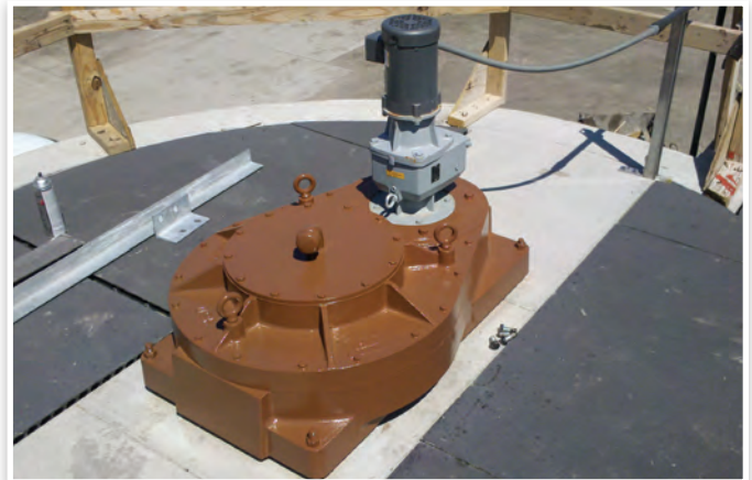
Submersible gear head.