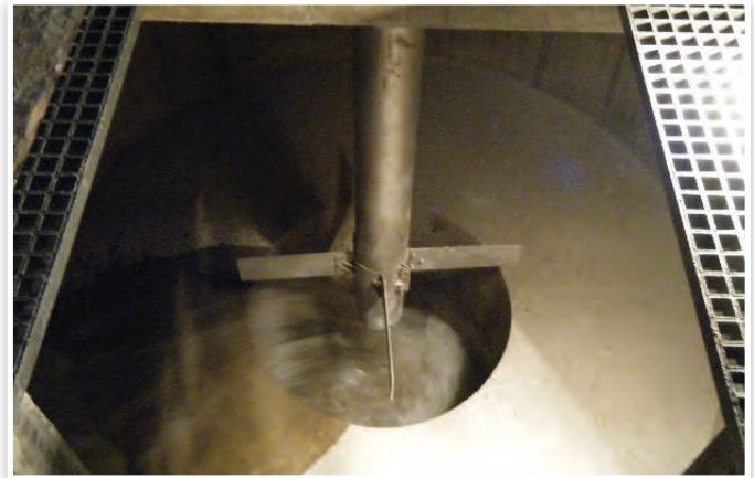
High efficiency X-impeller.