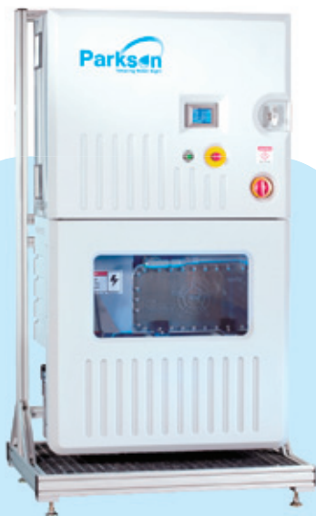
100 lbs./day self-cleaning electrolytic cell

MaximOS™ comes in different capacities with unique features like a self-cleaning electrolytic cell, self-adjusting flow control, remote monitoring, and gives the customer the flexibility to upgrade to the superior mixed oxidant chemistry.