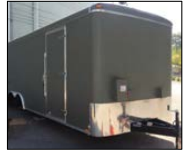
Monoclor™ trailer in place at Tice Reservoir

By using liquid ammonium sulfate and 0.8% sodium hypochlorite to generate monochloramine, a more stable monochloramine residual was achieved. The water booster pump and chemical metering pumps were all located inside the trailer with tubing leading to the reservoir and Tank Shark™ mixer. Installation of the Tank Shark™ mixer did not require divers or an outage because the unit was installed through the reservoir hatch without moving parts or electrical components. Utilizing the trailer option also simplified the permitting process for EBMUD and added flexibility for potential deployment to a different tank site.