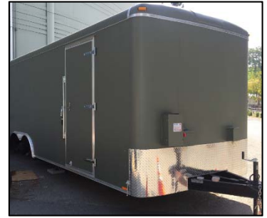
Monoclor™ trailer in place at Tice Reservoir

By using liquid ammonium sulfate and 0.8% sodium hypochlorite to generate monochloramine, a more stable monochloramine residual was achieved. The water booster pump and chemical metering pumps were all located inside the trailer with tubing leading to the reservoir and Tank Shark™ mixer. Installation of the Tank Shark™ mixer did not require divers or an outage because the unit was installed through the reservoir hatch without moving parts or electrical components. Utilizing the trailer option also simplified the permitting process for EBMUD and added flexibility for potential deployment to a different tank site.